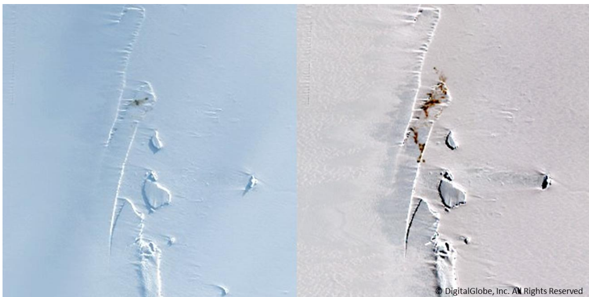
Fig S2: Satellite images of the Atka colony from 7. September 2013 (left) and 14. October 2013 (right). Faecal stains can be clearly identified on the ice shelf. After transitioning onto the shelf ice on 12. August 2013, the colony remained there in various locations until November.