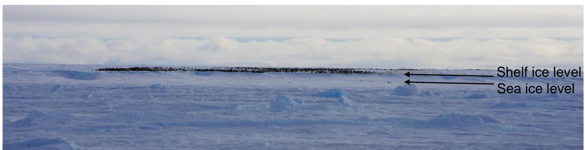
Fig S1: Emperor penguins on shelf ice on 16. November 2013. Due to large snow accumulation, multiple gradual snow ramps emerged and abolished the drop-off from the shelf ice to the sea ice.